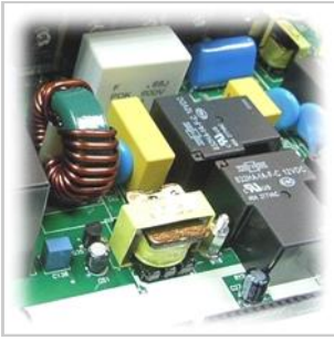
HIGH DC VOLT 16V/33/63V