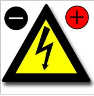
FUSE PROTECTION (DC REVERSE POLARITY)

Max 15.0V @ 12V Max 31.5V @ 24V Max 61.0V @ 48V